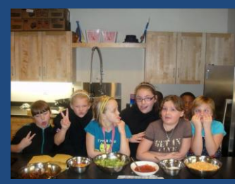
Grant recipients left to right: Clients of "Healing Expressions" – St. Andrew's Presbyterian Church; Graduates of CapaCITIES – Vibrant Communities/Community Sector Council; Meeting of the "Community Readiness for People with Disabilities", Canadian Paraplegic Association in St. Anthony; Children of the St. John's Boys & Girls Club benefit from the Breakfast Program.