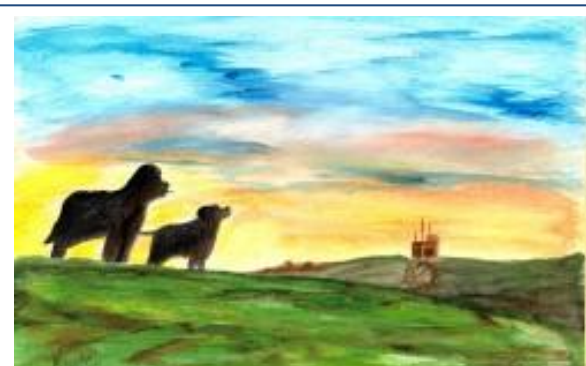
Pictured left: "Dr. Anstey's Guide to the Universe" – A publication that connects with Labrador teens on their level to offer helpful hints for coping with everyday life. Pictured above: Artwork created from the "Healing Expressions" program at St. Andrew's Presbyterian Church where recovering addicts and mental health consumers have an outlet for creativity.