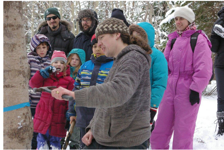
Families learn to tap maple trees at the Pippy Park Maple Tapping Festival.