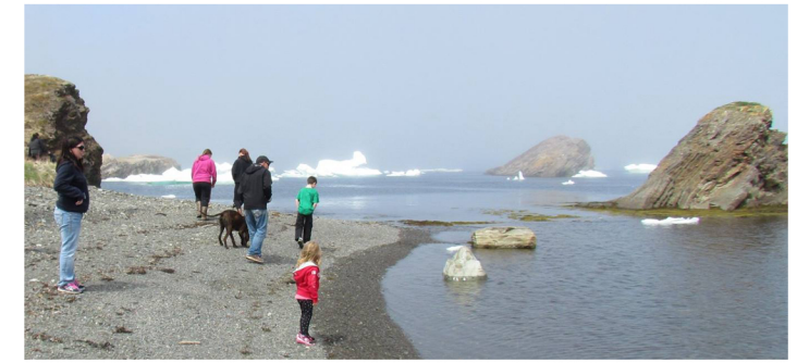
Community members clean the beach in Champney's West.