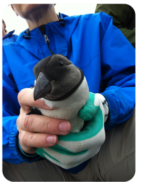
Volunteers for the Canadian Parks and Wilderness Society's Puffin and Petrel Patrol program rescued and released 729 pufflings in 2014.