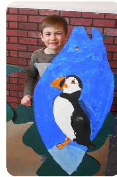
Children in Dover learned from a professional artist how to paint their own murals.