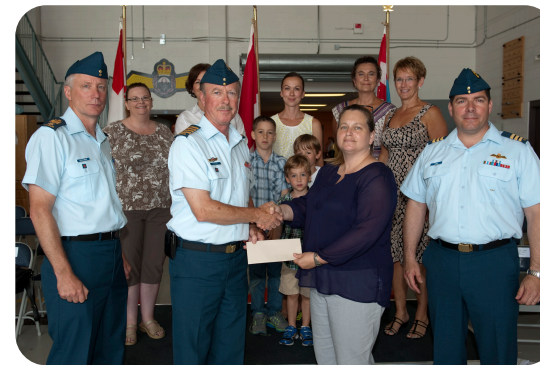
The Gander MFRC receives a $5000 boost from the Maple Leaf Fund as family members look on.

Media Partner: TC Media Funding Partners: Choices for Youth • Crosbie Group Ltd. • FFAW|Unifor • Memorial University Faculty of Medicine • Municipalities NL • Oceanex • Telus