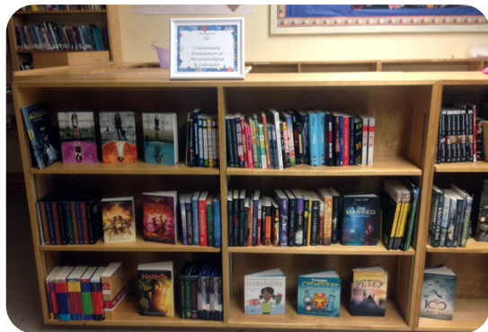
Prior to receiving a grant from CFNL, the students of District School had no reading materials apart from their textbooks.

and educates residents of coastal communities about the hazards posed to fledglings by bright artificial lights.