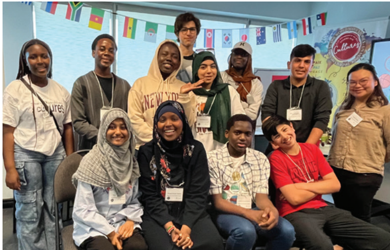
Community Fund Grant Recipient Sharing Our Cultures

CFNL inspires and facilitates community generosity, supporting local community organizations and projects so that communities across our province can thrive.