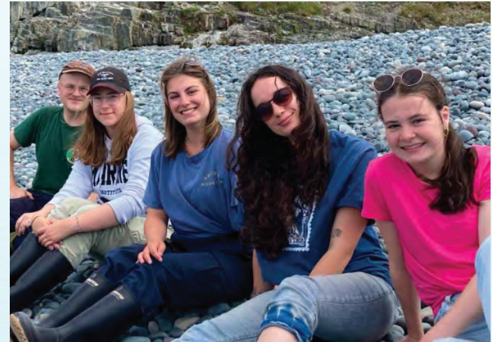
Folk of the Sea Fund Grant Recipient Fishing for Success

Giving back has long been part of life in this province.