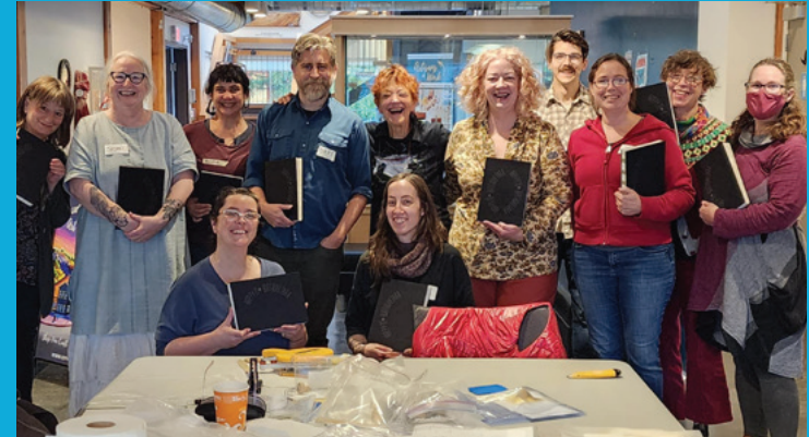
An artist workshop supported by the Tara Bryan Legacy Fund

“We all mourn in a different way, and for our family, it was creating this fund.”