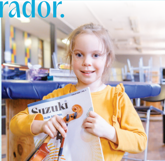
Community Fund Grant Recipient Strong Harbour Strings

Giving back has long been part of life in this province.